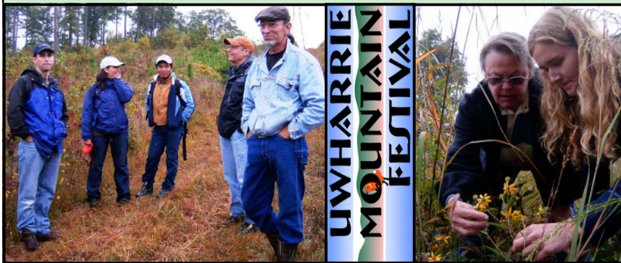
Participants brave the dreary weather in search of rare plants during a LandTrust led hike at the first annual Uwharrie Mountain Festival.