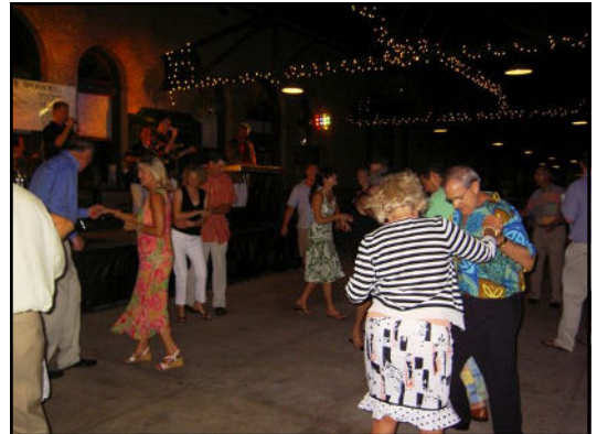
Guests enjoy dancing to the music of "Flashback."

Cheerwine Bottling Company Silver Eagle Distributors